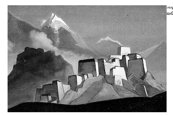
Roerich Painting -- Tibet as it Was

public celebration of Losar (New Year), the biggest Tibetan holiday of the year, to mourn the loss of Tibetan lives and the imprisonments and injuries of many Tibetans in 2008. They also had public meetings about the dire news in Tibet most of which did not reach the world's newspapers. I attended this event and share a photo, top right, on this page.