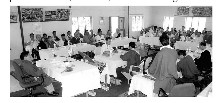
Mundgod Tibetan Legislative Assembly