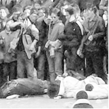
Tibet, March 2008

chosen by Beijing) are still not allowed into Tibet. The big picture is still tragic. Tibetans in the Mundgod Settlement cancelled their