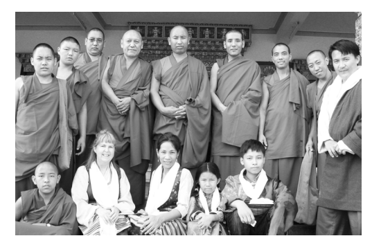
Chela joins graduation celebration