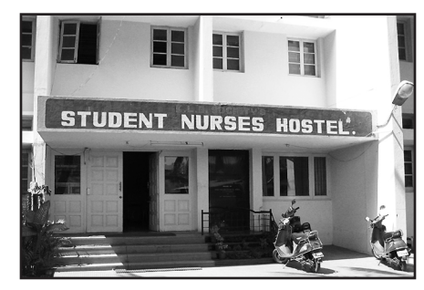
Student Nurses' Hostel